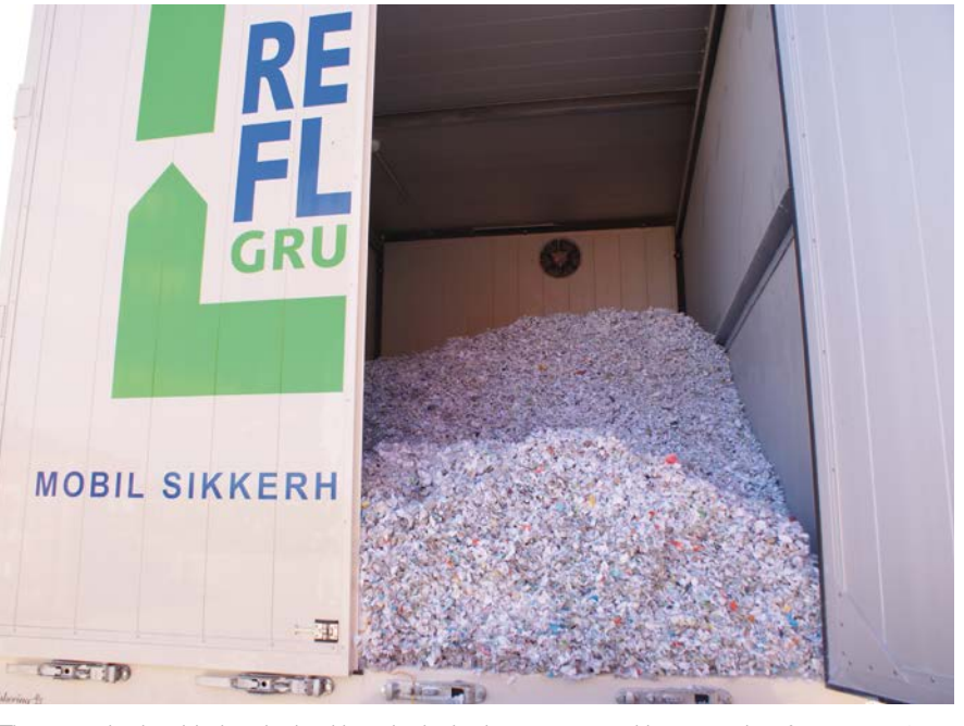
The paper is shredded and mixed into the locked cargo room with a capacity of approx. 5-6 tons shredded paper. The output material fulfills DIN norm 66399 security level P3/P4 through the mixing and the screen size of the shredder.