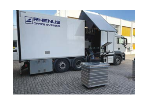
MAK II CT MAK