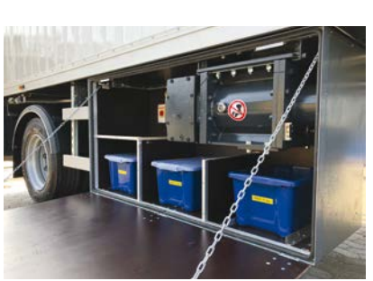
Optional hard drive shredder