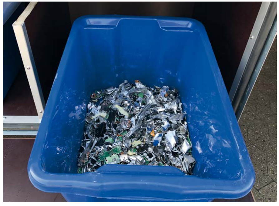
Destroyed hard drives.