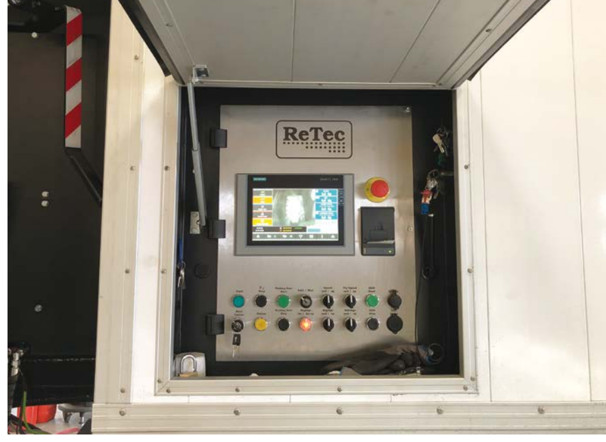
Integrated touch weight- and control panel for plant.