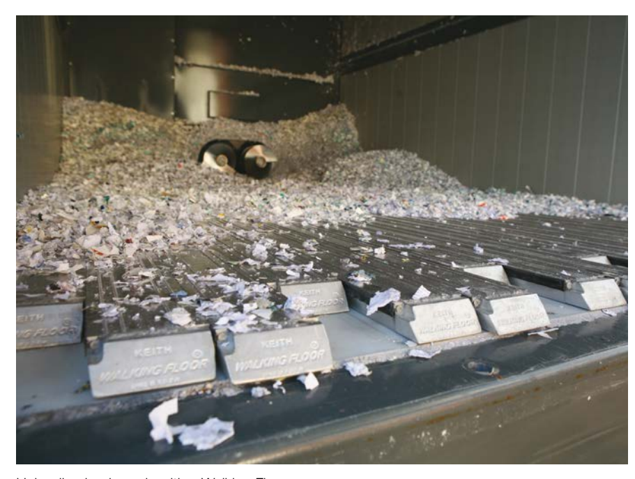
Unloading backwards with a Walking Floor.