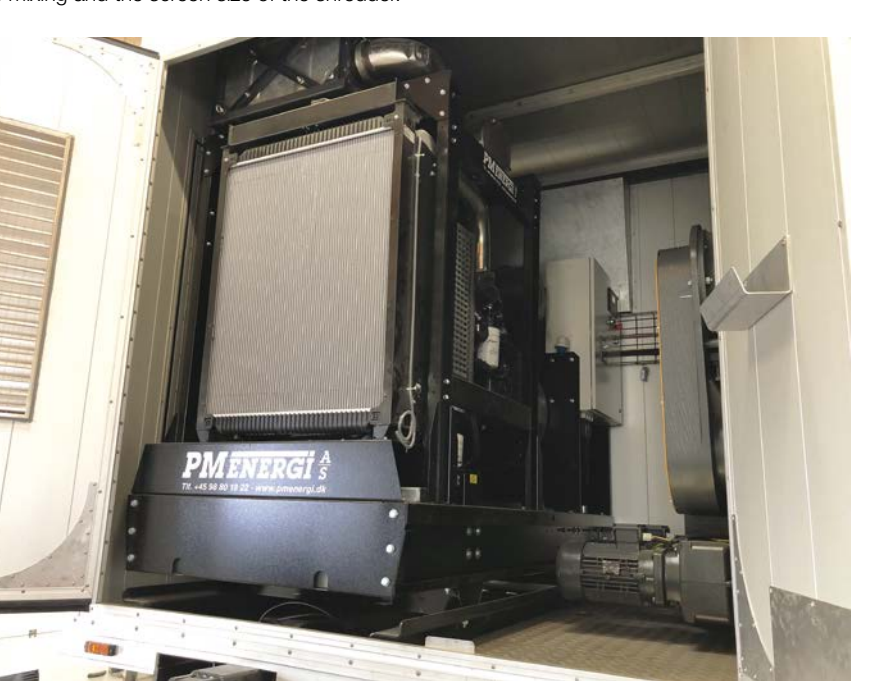
Engine room with diesel generator set and hydraulic station.