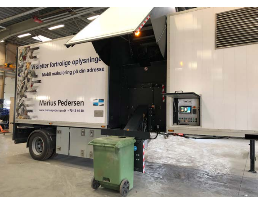
TÜV / Force approved weighing system for various bin sizes.