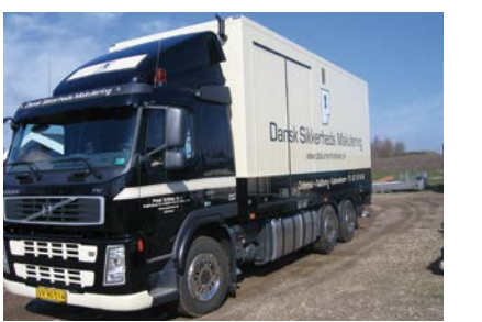
MAK II FL