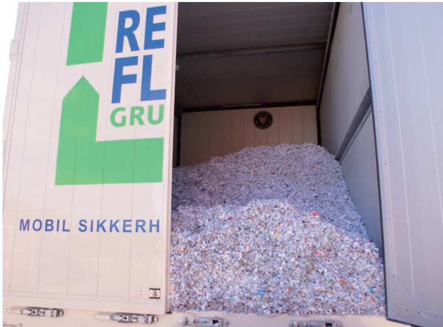
The paper is shredded and mixed into the locked cargo room with a capacity of approx. 5-6 tons shredded paper. The output material fulfills DIN norm 66399 security level P3/P4 through the mixing and the screen size of the shredder.