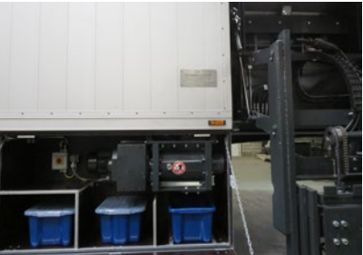
Hard drive shredder