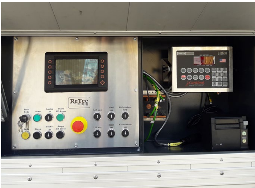
Touch weight- and control panel for plant.