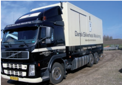
MAK II FL