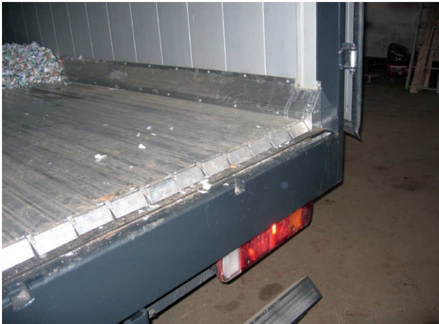
Unloading backwards with a Walking Floor.