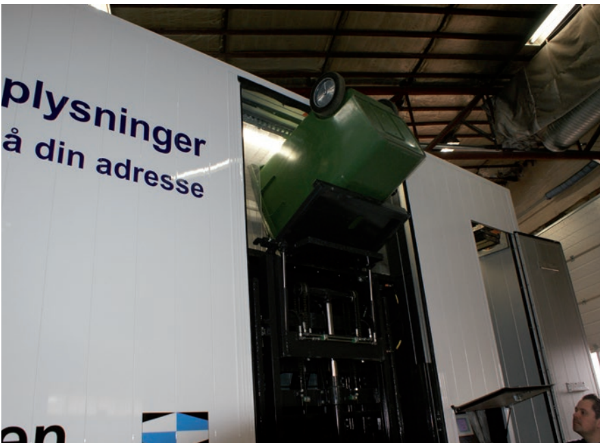
Feeding via bin lifter with weighing system for standard bins up to 660 l.