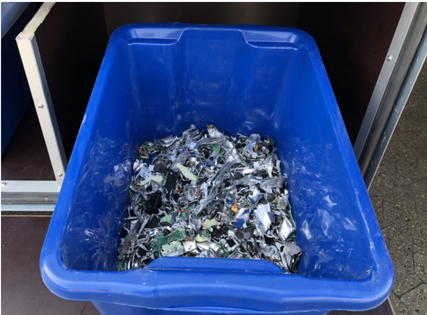
Destroyed hard drives.