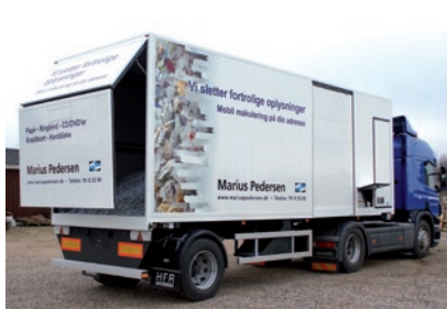
MAK II CT